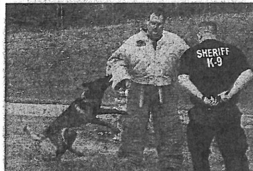
2 Indoor/Outdoor training facilities:

9319 Brittany Point Drive LR, AR 72206 2701 West Roosevelt Road, LR, AR 72204