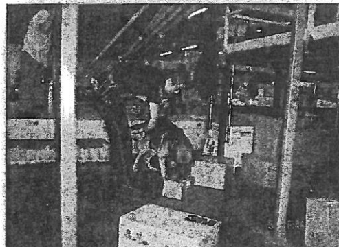
1 Police Vehicle Impound lot for Large/Small Vehicle Searches:

9319 Brittany Point Drive LR, AR 72206 2701 West Roosevelt Road, LR, AR 72204