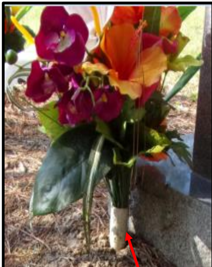
Acceptable Height Approximate Height 4" above ground

PVC Flower Holders must have the top of the holder at least 4" to 6" above ground level to ensure flowers are not damaged by weed eaters. An example of an acceptable PVC Flower Holder is shown below is shown below: